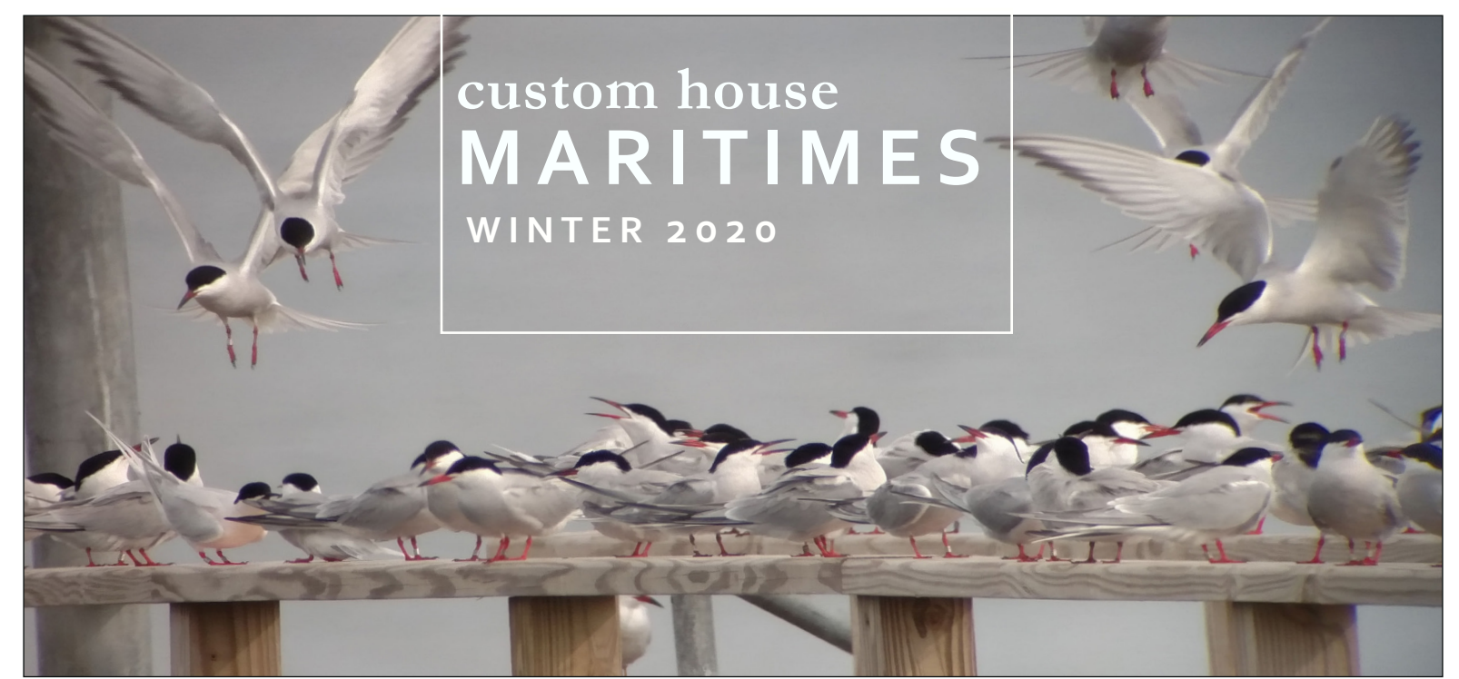
MATTHEW MALE - My View from Great Gull Island - Photos from the edge of The Sound will be on view at the Custom House through March 29, 2020.