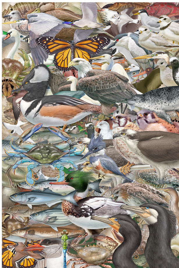
THE MARINE & COASTAL LIFE OF LONG ISLAND SOUND