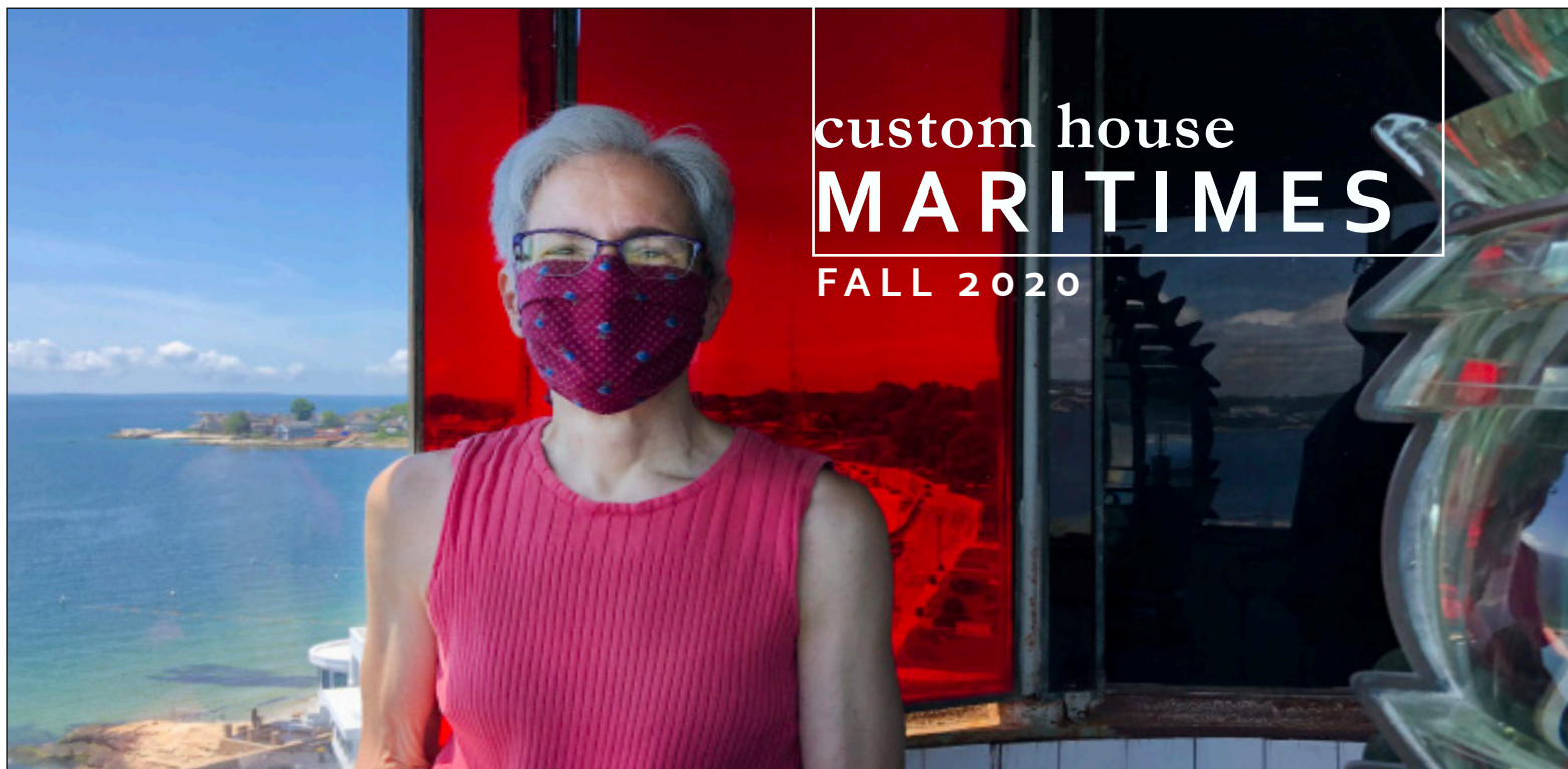
We give tours inside New London Harbor Pequot Lighthouse year-round, above .