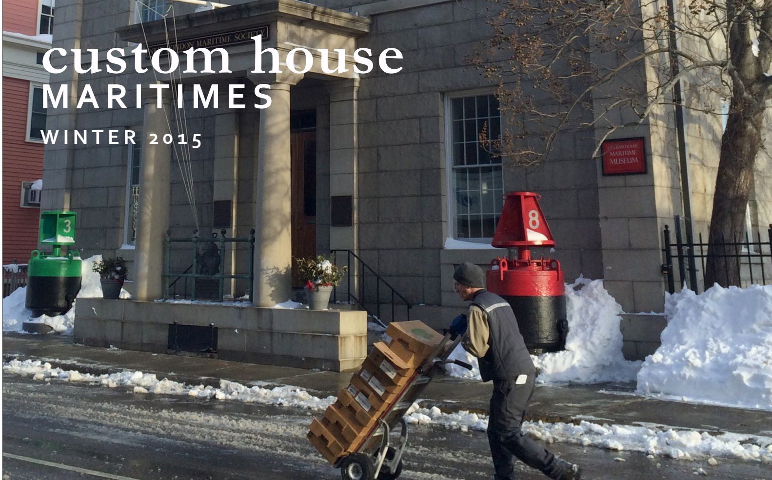
Above, Custom House Maritime Museum, January 2015, in the clear winter light.