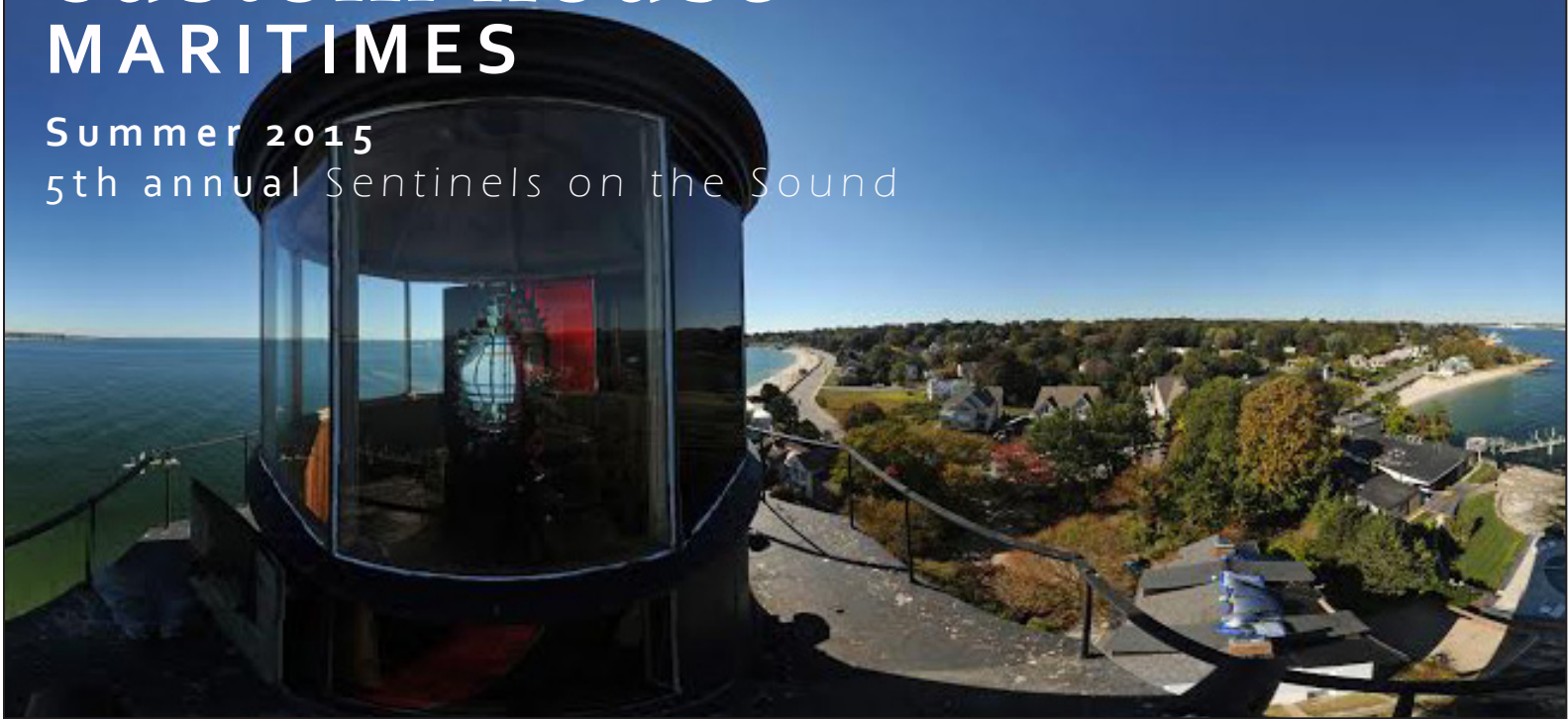
Above: The world as seen from the lantern of New London Harbor Light.