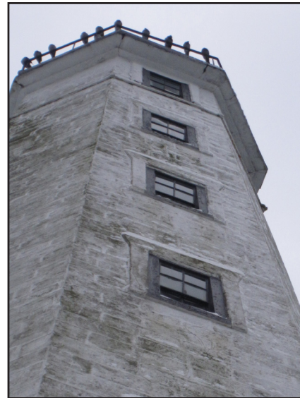
It will cost about $100,000 to scaffold, tent, scrape, and repaint the lighthouse. We also have damage from Superstorm Sandy to fix, including the walkway and sea walls. Over time, we also hope to rebuild the dock. Watch for our fund-raisers or donate at nlmaritimesociety.org .