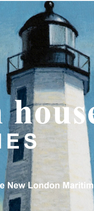
New London Harbor Light (detail). United States Postal Service 2013. Howard Koslow.

Celebrating 30 years of the New London Maritime Society