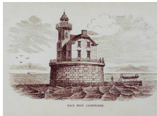
1909 postcard image